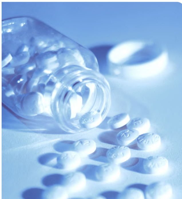
Aspirin can play an important role in preventing stroke because it helps keep blood from clotting.

Sometimes a stroke is the first sign a person has of other health conditions, such as high blood pressure, diabetes, atrial fibrillation (a heart rhythm disorder) or other vascular disease. If any of these are diagnosed, the health care team will prescribe appropriate treatment.